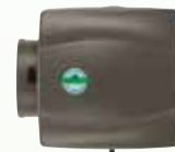
HCWB3-12 Bypass Humidifier 12 gallons per day