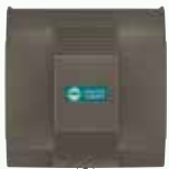
HCWP3-18 Power Humidifier 18 gallons per day

Equipped with a built-in fan, a Power Humidifier circulates humidified air. Since it works independently of your HVAC system, it can deliver humidity even when your system isn't running.