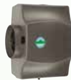
HCWB3-17 Bypass Humidifier 17 gallons per day

Bypass Humidifiers work in conjunction with your HVAC system, using the air handler or furnace fan to direct humidified air throughout the home.